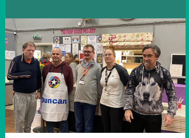
Serving at the Pump House Project