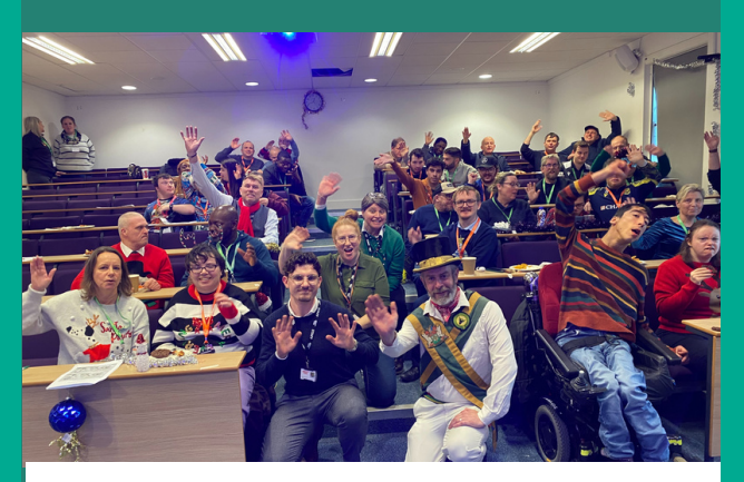
Having fun at the ALD Christmas Party

This section celebrates some of our learners' achievements.